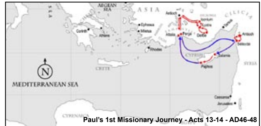
Paul's 1st Missionary Journey - Acts 13-14 - AD46-48

See last week's sheet for notices about Student Accommodation in Belfast Scotland Holiday Conference 2010